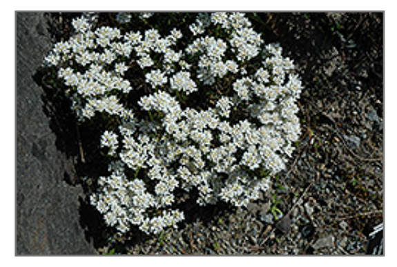
Snowflake Candytuft in bloom

315 Coleman Road McDonald, PA 15057 (724) 926-2541