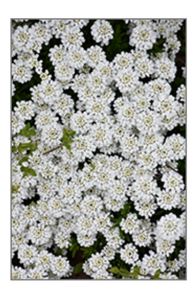
Snowflake Candytuft flowers

Snowflake Candytuft is recommended for the following landscape applications;