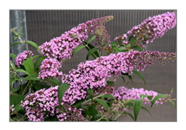
Pink Delight Butterfly Bush flowers

This is a relatively low maintenance shrub, and is best pruned in late winter once the threat of extreme cold has passed. It is a good choice for attracting bees, butterflies and hummingbirds to your yard, but is not particularly attractive to deer who tend to leave it alone in favor of tastier treats. It has no significant negative characteristics.