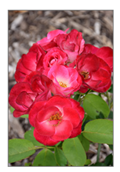
Firecracker Easy Elegance Rose flowers

Firecracker Easy Elegance Rose features showy fragrant red flowers with yellow eyes and white centers at the ends of the branches from late spring to early fall. The flowers are excellent for cutting. It has green deciduous foliage. The glossy oval compound leaves do not develop any appreciable fall color. The fruits are showy red hips displayed in late fall.