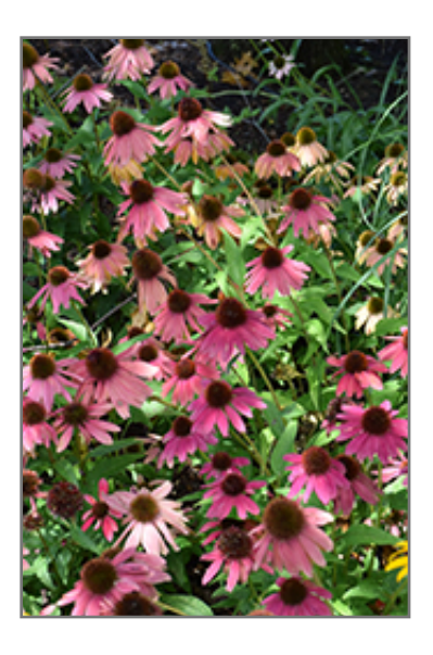
Artisan Red Ombre Coneflower flowers

This plant should only be grown in full sunlight. It is very adaptable to both dry and moist locations, and should do just fine under typical garden conditions. It is considered to be drought-tolerant, and thus makes an ideal choice for a low-water garden or xeriscape application. It is not particular as to soil type or pH. It is highly tolerant of urban pollution and will even thrive in inner city environments. This particular variety is an interspecific hybrid. It can be propagated by division; however, as a cultivated variety, be aware that it may be subject to certain restrictions or prohibitions on propagation.