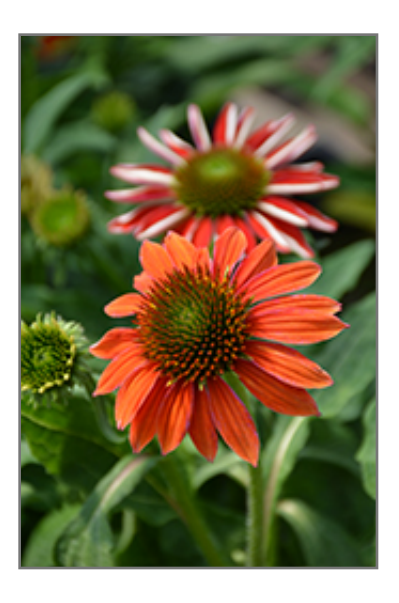
Artisan Red Ombre Coneflower flowers

This is a relatively low maintenance plant, and is best cleaned up in early spring before it resumes active growth for the season. It is a good choice for attracting butterflies to your yard, but is not particularly attractive to deer who tend to leave it alone in favor of tastier treats. It has no significant negative characteristics.