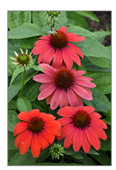
Artisan Red Ombre Coneflower flowers