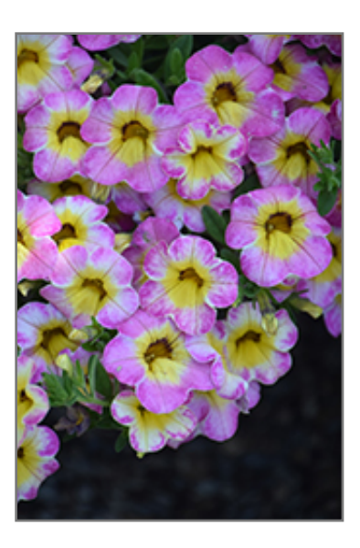
Cha-Cha Diva Hot Pink Calibrachoa flowers