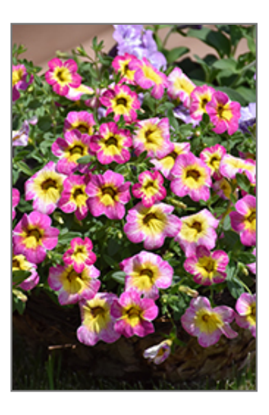
Cha-Cha Diva Hot Pink Calibrachoa flowers

Cha-Cha Diva Hot Pink Calibrachoa is recommended for the following landscape applications;