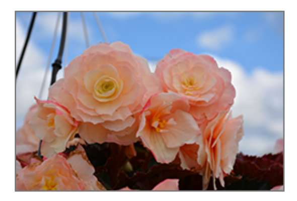
l'Conia Portofino Champagne Begonia flowers

This is a high maintenance plant that will require regular care and upkeep, and usually looks its best without pruning, although it will tolerate pruning. Deer don't particularly care for this plant and will usually leave it alone in favor of tastier treats. Gardeners should be aware of the following characteristic(s) that may warrant special consideration;