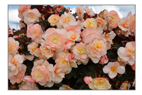
l'Conia Portofino Champagne Begonia flowers

l'Conia Portofino Champagne Begonia will grow to be about 12 inches tall at maturity, with a spread of 18 inches. When grown in masses or used as a bedding plant, individual plants should be spaced approximately 14 inches apart. Its foliage tends to remain dense right to the ground, not requiring facer plants in front. Although it's not a true annual, this plant can be expected to behave as an annual in our climate if left outdoors over the winter, usually needing replacement the following year. As such, gardeners should take into consideration that it will perform differently than it would in its native habitat.