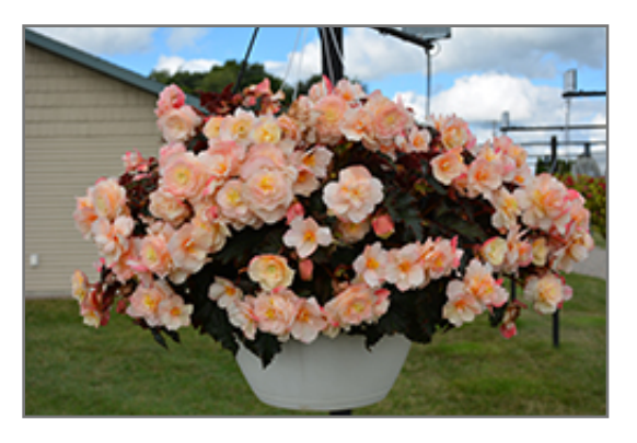
l'Conia Portofino Champagne Begonia in bloom

315 Coleman Road McDonald, PA 15057 (724) 926-2541