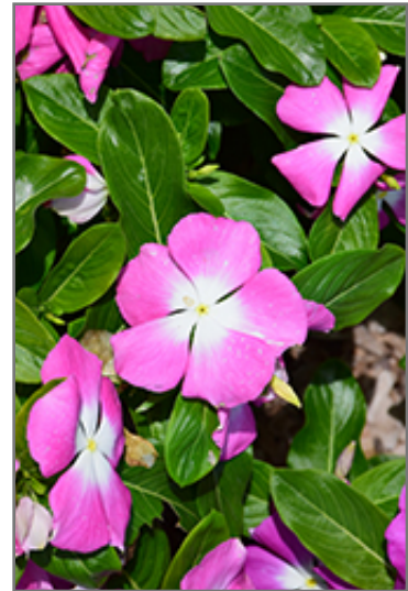
Mega Bloom Pink Halo Vinca flowers

This plant will require occasional maintenance and upkeep, and should not require much pruning, except when necessary, such as to remove dieback. It is a good choice for attracting butterflies to your yard, but is not particularly attractive to deer who tend to leave it alone in favor of tastier treats. It has no significant negative characteristics.