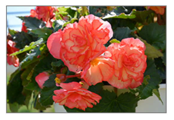
On Top Sun Glow Begonia flowers