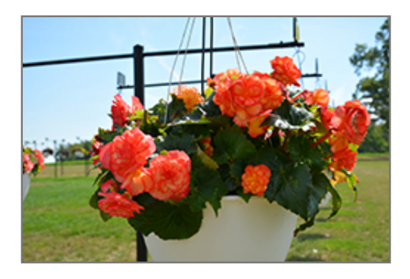
On Top Sun Glow Begonia in bloom

315 Coleman Road McDonald, PA 15057 (724) 926-2541