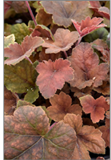
Pumpkin Spice Foamy Bells foliage

Pumpkin Spice Foamy Bells is recommended for the following landscape applications;