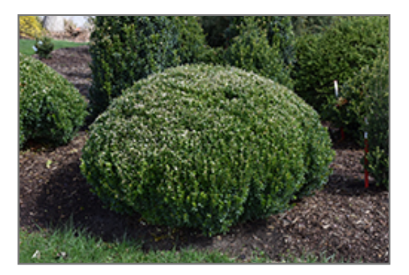
Sprinter Boxwood

This compact boxwood is great for smaller areas; foliage bronzes in winter adding seasonal interest; a faster growing, extremely versatile shrub that's ideal for small and formal hedges or topiary, takes pruning exceptionally well