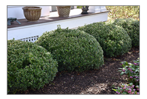
Sprinter Boxwood

Sprinter Boxwood will grow to be about 4 feet tall at maturity, with a spread of 4 feet. It tends to fill out right to the ground and therefore doesn't necessarily require facer plants in front. It grows at a fast rate, and under ideal conditions can be expected to live for approximately 30 years.