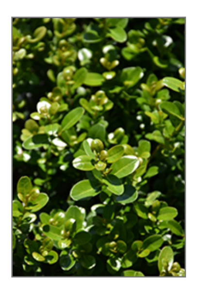
Sprinter Boxwood foliage

Sprinter Boxwood is recommended for the following landscape applications;