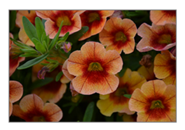
MiniFamous Neo Orange + Red Eye Calibrachoa flowers