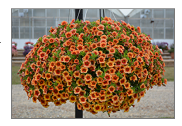
MiniFamous Neo Orange + Red Eye Calibrachoa in bloom