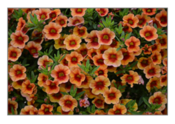
MiniFamous Neo Orange + Red Eye Calibrachoa flowers

MiniFamous Neo Orange + Red Eye Calibrachoa is a dense herbaceous annual with a trailing habit of growth, eventually spilling over the edges of hanging baskets and containers. Its medium texture blends into the garden, but can always be balanced by a couple of finer or coarser plants for an effective composition.