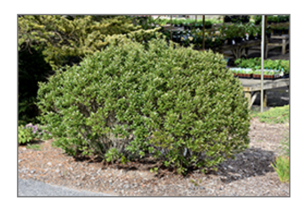
Steeds Japanese Holly

Steeds Japanese Holly is recommended for the following landscape applications;