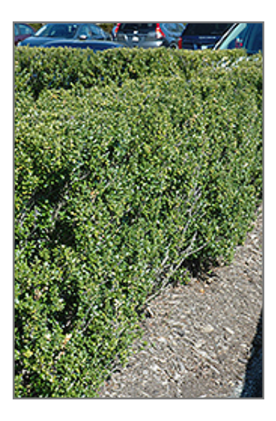
Steeds Japanese Holly

* This is a 'special order' plant - contact store for details