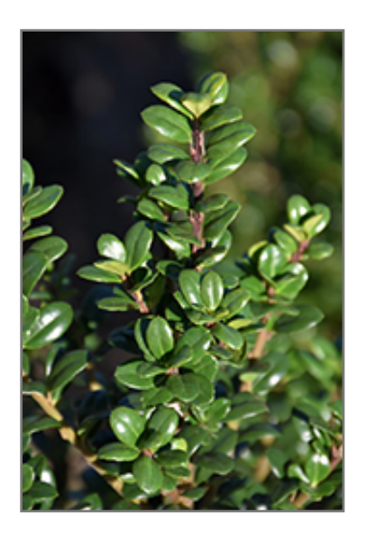
Steeds Japanese Holly foliage