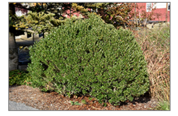
Shamrock Inkberry Holly

This shrub will require occasional maintenance and upkeep, and is best pruned in late winter once the threat of extreme cold has passed. Gardeners should be aware of the following characteristic(s) that may warrant special consideration;