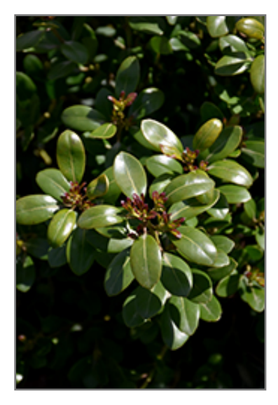
Shamrock Inkberry Holly foliage