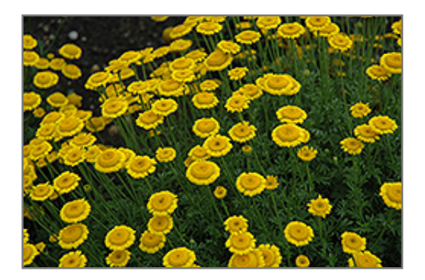
Charme Marguerite Daisy flowers

A charming display of bright yellow flowers in late spring and early summer, covering a mound of foliage that is feathery and finely cut; excellent for beds and containers