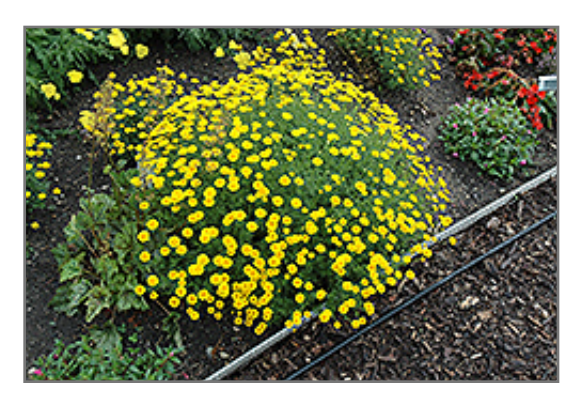
Charme Marguerite Daisy in bloom

Charme Marguerite Daisy is recommended for the following landscape applications;