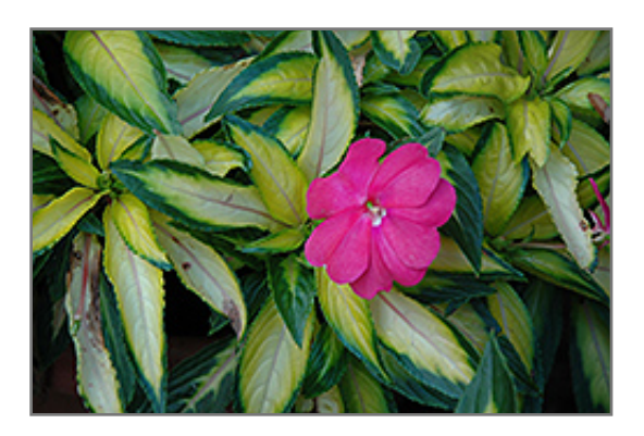
Strike Pink New Guinea Impatiens flowers

Strike Pink New Guinea Impatiens is recommended for the following landscape applications;