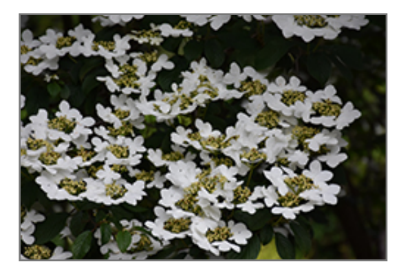
Summer Snowflake Doublefile Viburnum flowers

315 Coleman Road McDonald, PA 15057 (724) 926-2541