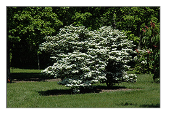
Summer Snowflake Doublefile Viburnum in bloom

Summer Snowflake Doublefile Viburnum will grow to be about 6 feet tall at maturity, with a spread of 6 feet. It tends to fill out right to the ground and therefore doesn't necessarily require facer plants in front, and is suitable for planting under power lines. It grows at a medium rate, and under ideal conditions can be expected to live for 40 years or more.