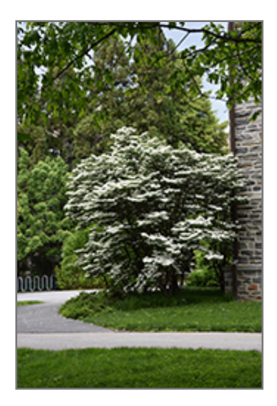
Summer Snowflake Doublefile Viburnum in bloom

This is a relatively low maintenance shrub, and should only be pruned after flowering to avoid removing any of the current season's flowers. It is a good choice for attracting birds to your yard, but is not particularly attractive to deer who tend to leave it alone in favor of tastier treats. It has no significant negative characteristics.