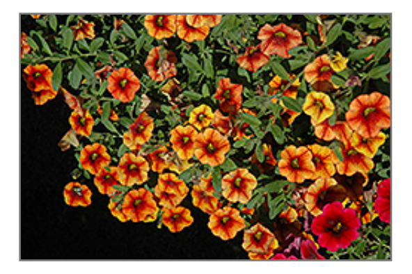
Superbells Spicy Calibrachoa flowers

Superbells Spicy Calibrachoa is recommended for the following landscape applications;