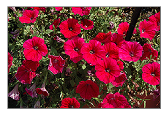
Hardiness Zone: (annual)

Height: 18 inches Spread: 18 inches Spacing: 15 inches Sunlight: O