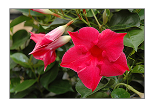
Sun Parasol Carmine King Mandevilla flowers

Large, elegant blooms appear on this vigorous, twining vine from early summer until fall; large, deep green foliage serves as the perfect contrast; great for arbors, garden walls, containers or baskets