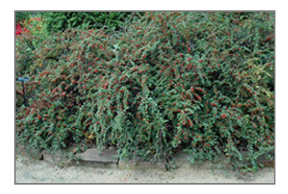
Cranberry Cotoneaster

315 Coleman Road McDonald, PA 15057 (724) 926-2541