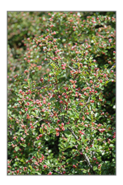
Cranberry Cotoneaster flowers

* This is a 'special order' plant - contact store for details