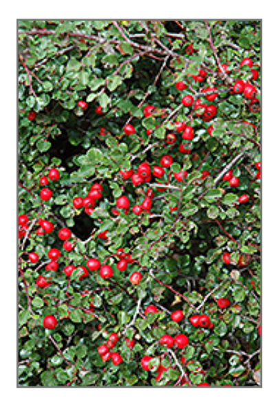
Cranberry Cotoneaster fruit

Cranberry Cotoneaster is recommended for the following landscape applications;