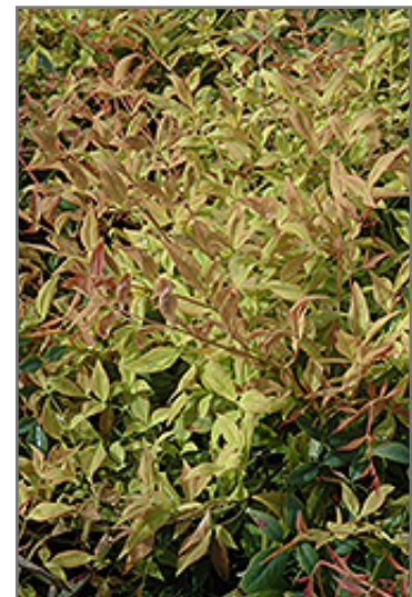
Gulf Stream Dwarf Nandina foliage