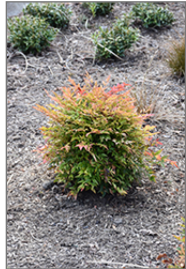
Gulf Stream Dwarf Nandina