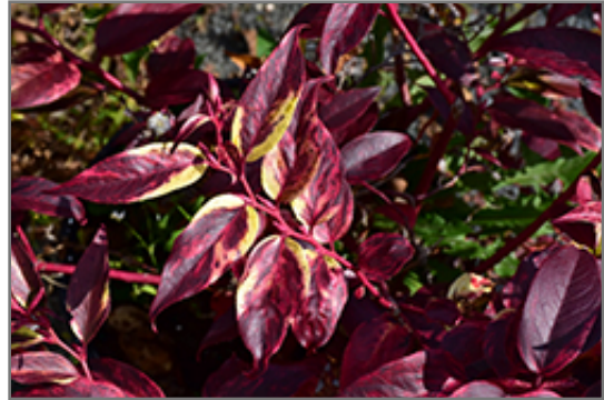
Rainbow Fetterbush in fall

Rainbow Fetterbush will grow to be about 5 feet tall at maturity, with a spread of 6 feet. It tends to fill out right to the ground and therefore doesn't necessarily require facer plants in front, and is suitable for planting under power lines. It grows at a medium rate, and under ideal conditions can be expected to live for approximately 20 years.