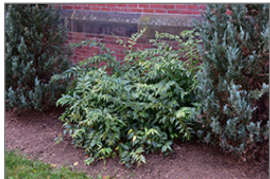
Rainbow Fetterbush