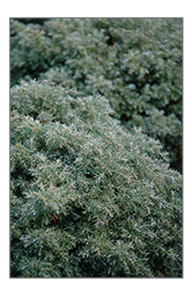
Cumulus Falsecypress foliage

Cumulus Falsecypress will grow to be about 3 feet tall at maturity, with a spread of 3 feet. It tends to fill out right to the ground and therefore doesn't necessarily require facer plants in front. It grows at a medium rate, and under ideal conditions can be expected to live for 70 years or more.