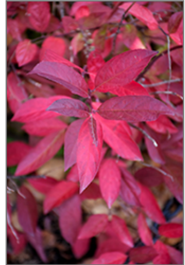
Henry's Garnet Virginia Sweetspire in fall

This shrub performs well in both full sun and full shade. It is an amazingly adaptable plant, tolerating both dry conditions and even some standing water. It is not particular as to soil type or pH. It is somewhat tolerant of urban pollution. This is a selection of a native North American species.