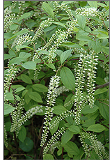
Henry's Garnet Virginia Sweetspire flowers