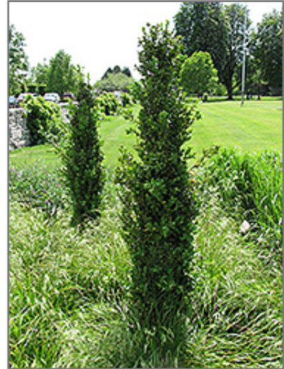
Graham Blandy Boxwood