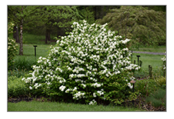
Popcorn Doublefile Viburnum in bloom

This is a relatively low maintenance shrub, and should only be pruned after flowering to avoid removing any of the current season's flowers. It is a good choice for attracting birds to your yard, but is not particularly attractive to deer who tend to leave it alone in favor of tastier treats. It has no significant negative characteristics.