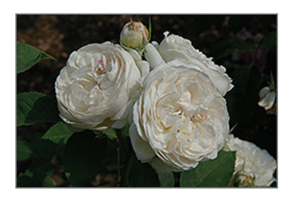
Winchester Cathedral Rose flowers

A lovely elegant variety with snowy white blooms with occasionally the slightest touch of shell pink at the center; the effect is tremendous, with a mass of flowers held on a full bushy shrub, blooming at regular intervals all season