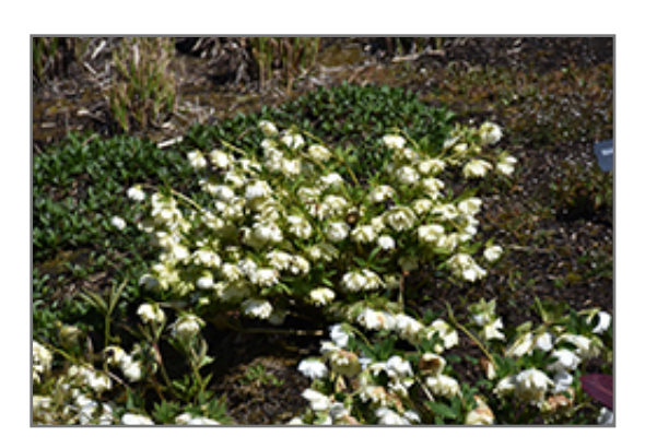
Sparkling Diamond Hellebore in bloom