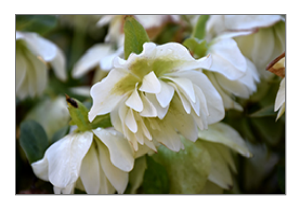
Sparkling Diamond Hellebore flowers

Sparkling Diamond Hellebore is an herbaceous evergreen perennial with an upright spreading habit of growth. Its medium texture blends into the garden, but can always be balanced by a couple of finer or coarser plants for an effective composition.