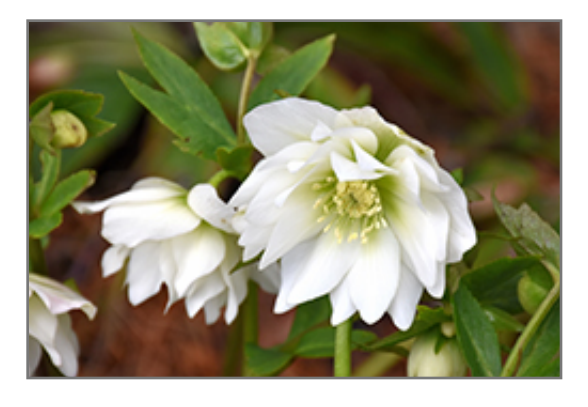
Sparkling Diamond Hellebore flowers