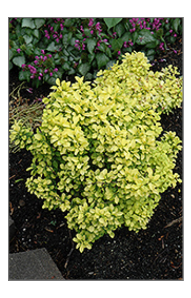
Sunjoy Gold Beret Dwarf Japanese Barberry

This shrub will require occasional maintenance and upkeep, and should not require much pruning, except when necessary, such as to remove dieback. Deer don't particularly care for this plant and will usually leave it alone in favor of tastier treats. Gardeners should be aware of the following characteristic(s) that may warrant special consideration;