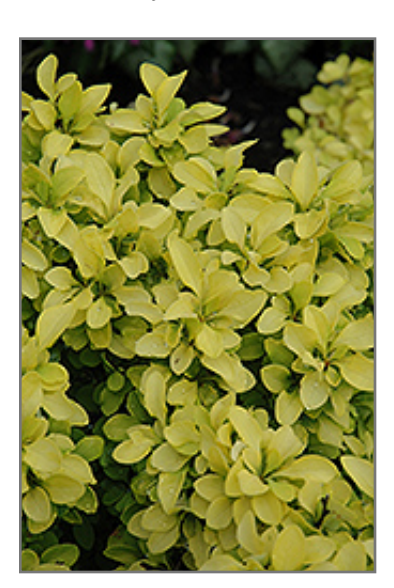
Sunjoy Gold Beret Dwarf Japanese Barberry foliage