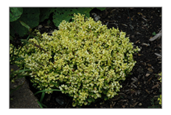
Sunjoy Gold Beret Dwarf Japanese Barberry

Sunjoy Gold Beret Dwarf Japanese Barberry will grow to be about 12 inches tall at maturity, with a spread of 12 inches. It tends to fill out right to the ground and therefore doesn't necessarily require facer plants in front. It grows at a slow rate, and under ideal conditions can be expected to live for approximately 20 years.