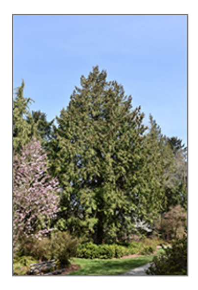
Western Arborvitae