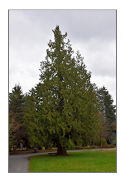
Western Arborvitae