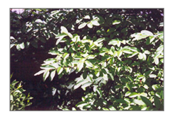
Border Privet foliage

A rugged large shrub for use in formal hedges, takes pruning exceptionally well; interesting flowers (if not pruned) followed by black berries in fall; easy to grow, handles polluted city conditions well, very popular