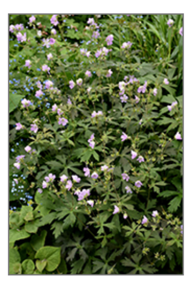
Espresso Cranesbill in bloom

Espresso Cranesbill will grow to be about 18 inches tall at maturity, with a spread of 24 inches. When grown in masses or used as a bedding plant, individual plants should be spaced approximately 20 inches apart. Its foliage tends to remain dense right to the ground, not requiring facer plants in front. It grows at a medium rate, and under ideal conditions can be expected to live for approximately 10 years. As an herbaceous perennial, this plant will usually die back to the crown each winter, and will regrow from the base each spring. Be careful not to disturb the crown in late winter when it may not be readily seen!