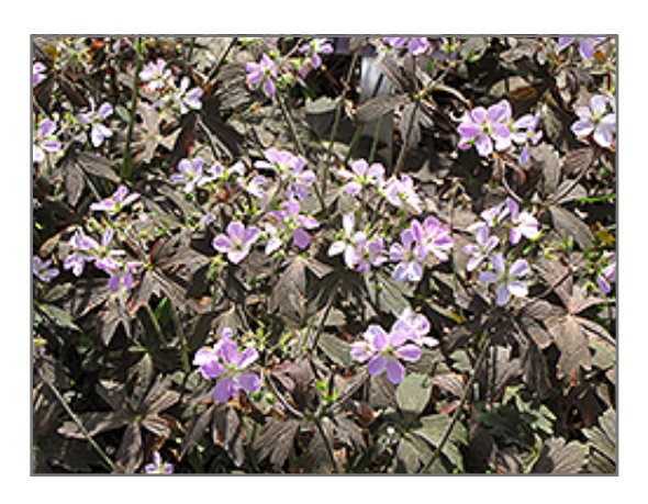
Espresso Cranesbill flowers