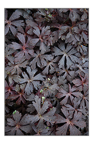
Espresso Cranesbill foliage

This plant will require occasional maintenance and upkeep, and should only be pruned after flowering to avoid removing any of the current season's flowers. Deer don't particularly care for this plant and will usually leave it alone in favor of tastier treats. Gardeners should be aware of the following characteristic(s) that may warrant special consideration;