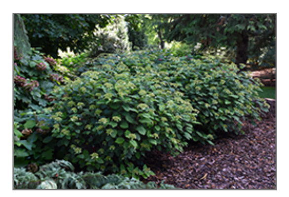
Invincibelle Lace Hydrangea in bloom