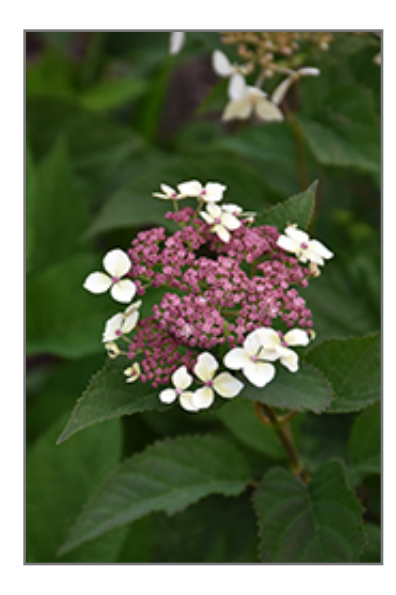
Invincibelle Lace Hydrangea flowers

Invincibelle Lace Hydrangea is a multi-stemmed deciduous shrub with a more or less rounded form. Its relatively coarse texture can be used to stand it apart from other landscape plants with finer foliage.