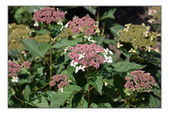
Invincibelle Lace Hydrangea flowers