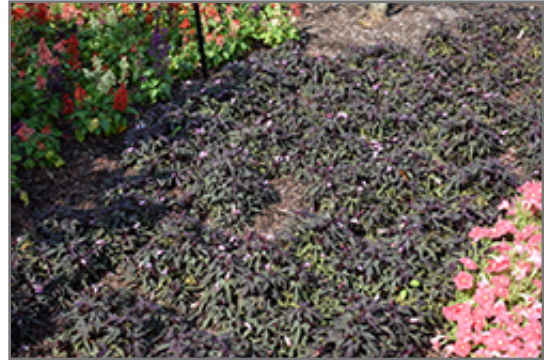
Floramia Cameo Sweet Potato Vine in bloom

Floramia Cameo Sweet Potato Vine will grow to be about 8 inches tall at maturity, with a spread of 24 inches. When grown in masses or used as a bedding plant, individual plants should be spaced approximately 20 inches apart. Its foliage tends to remain low and dense right to the ground. This fast-growing annual will normally live for one full growing season, needing replacement the following year.