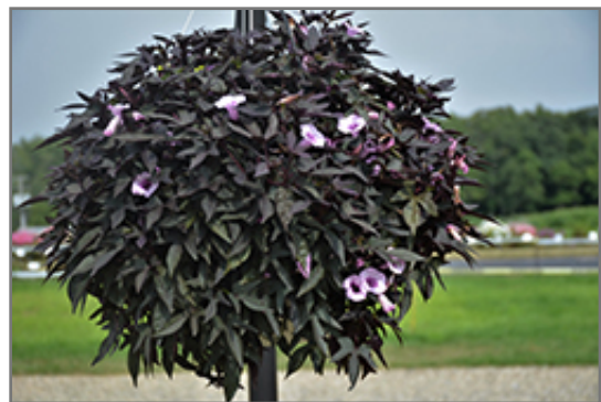
Floramia Cameo Sweet Potato Vine