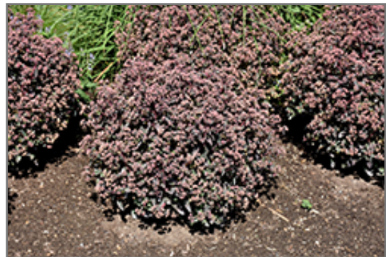
Rock 'N Grow Tiramisu Stonecrop in bloom