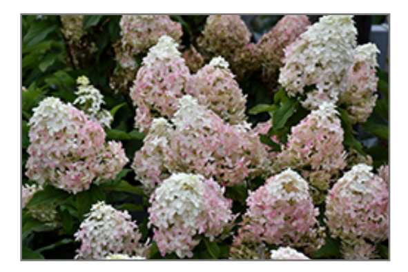
Quick Fire Fab Hydrangea flowers

This fabulous variety blooms a full month ahead of other panicle hydrangeas for about the longest season of bloom a shrub can have; features huge, mophead flowers that start white and fade through pink to a rich rose-red, lasting into fall