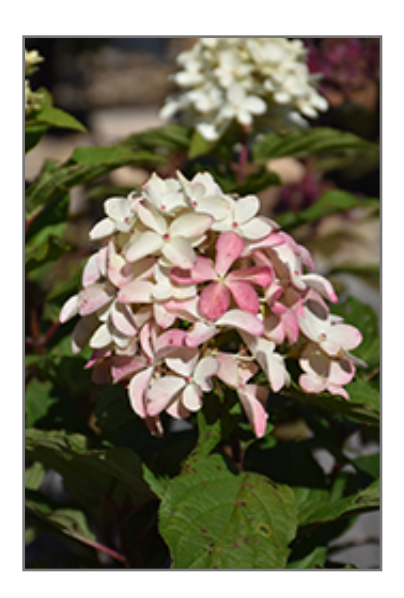
Quick Fire Fab Hydrangea flowers

Quick Fire Fab Hydrangea is recommended for the following landscape applications;