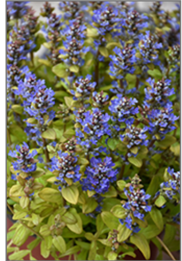
Feathered Friends Fancy Finch Bugleweed flowers

This plant will require occasional maintenance and upkeep, and should not require much pruning, except when necessary, such as to remove dieback. It is a good choice for attracting butterflies to your yard, but is not particularly attractive to deer who tend to leave it alone in favor of tastier treats. Gardeners should be aware of the following characteristic(s) that may warrant special consideration;