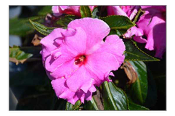
Roller Coaster Valravn Violet Impatiens flowers

315 Coleman Road McDonald, PA 15057 (724) 926-2541