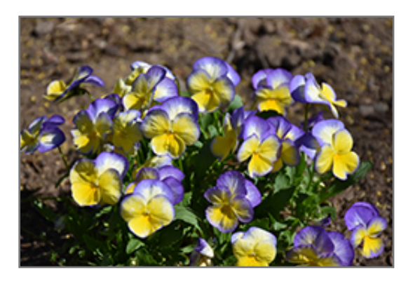
Halo Lemon Frost Pansy flowers

Halo Lemon Frost Pansy is an herbaceous perennial with a mounded form. Its relatively fine texture sets it apart from other garden plants with less refined foliage.