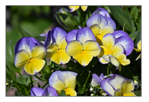
Halo Lemon Frost Pansy flowers