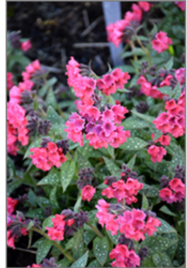
Shrimps On The Barbie Lungwort flowers

This is a relatively low maintenance plant, and should be cut back in late fall in preparation for winter. It is a good choice for attracting bees, butterflies and hummingbirds to your yard, but is not particularly attractive to deer who tend to leave it alone in favor of tastier treats. It has no significant negative characteristics.