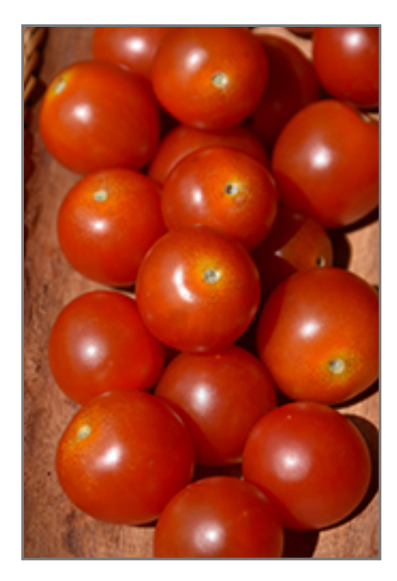
Red Robin Tomato fruit