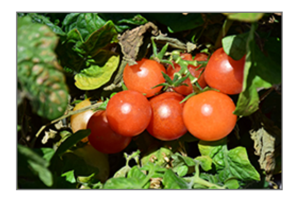
Red Robin Tomato fruit