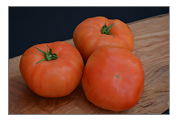
Classic Beefsteak Tomato fruit

Classic Beefsteak Tomato will grow to be about 6 feet tall at maturity, with a spread of 24 inches. When planted in rows, individual plants should be spaced approximately 3 feet apart. Because of its vigorous growth habit, it may require staking or supplemental support. This fast-growing vegetable plant is an annual, which means that it will grow for one season in your garden and then die after producing a crop.