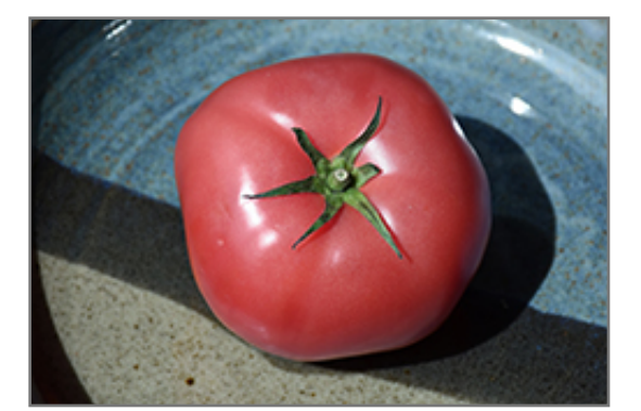
Brandywine Pink Tomato fruit

Brandywine Pink Tomato will grow to be about 4 feet tall at maturity, with a spread of 18 inches. When planted in rows, individual plants should be spaced approximately 12 inches apart. Because of its vigorous growth habit, it may require staking or supplemental support. This fast-growing vegetable plant is an annual, which means that it will grow for one season in your garden and then die after producing a crop.