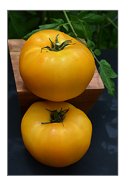
Brandywine Yellow Tomato fruit

A beautiful heirloom variety that produces large, round, yellow fruit with a rich old fashioned tomato flavor; juicy yet firm, these tomatoes are perfect for sandwiches, salads, slicing and even stuffing; staking is recommended