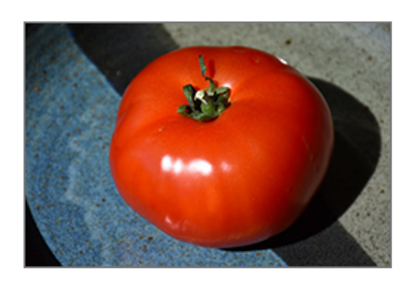
Bush Early Girl Tomato fruit

A perfect compact bush variety, ideal for patio containers and small gardens; high yields of beautiful round red fruit with an excellent flavor and firm skin; a great selection for sandwiches, salads and salsas; heat tolerant and disease resistant