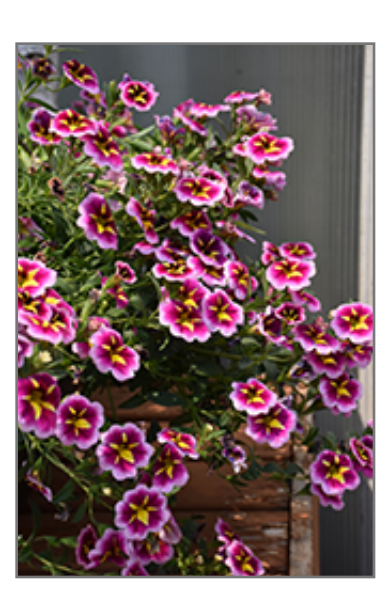
Can-Can Bumble Bee Pink Calibrachoa flowers

A beautiful, semi-trailing variety that produces gorgeous two toned pink blooms with a dramatic center yellow star; perfect for hanging baskets, containers, borders and garden landscapes; heat tolerant and low maintenance; deadhead to encourage new blooms