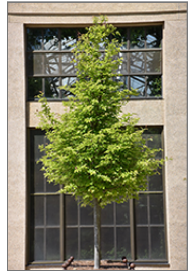
Persian Parrotia