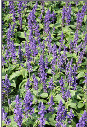
Mysty Salvia flowers

315 Coleman Road McDonald, PA 15057 (724) 926-2541