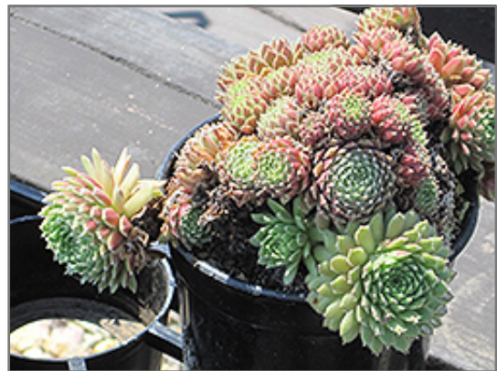
Jade Rose Hens And Chicks