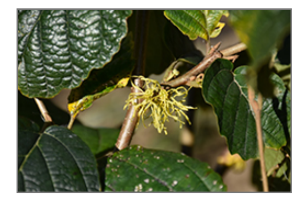
Harvest Moon Witchhazel flowers

315 Coleman Road McDonald, PA 15057 (724) 926-2541